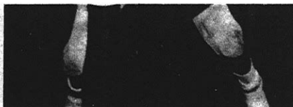
"Romping" Reggie Key