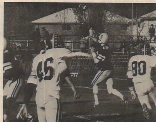
The Football Team had an excellent season. They lost to Aquinas in league and then defeated them in playoffs. We missed a Sec.V title by one foot and 20 seconds to Fairport.