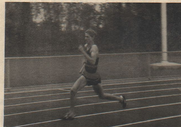
The Outdoor Track team had a very good season. It was the top ranked Sec.V team all season, and as usual, on the team there was great depth. Our 3200 meter Relay at State captured 5th place.