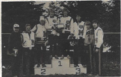
1984-85 State Champs

This photo of the Cross Country Team on the Section V victory stand was a prelude to them becoming N.Y. State Champions.