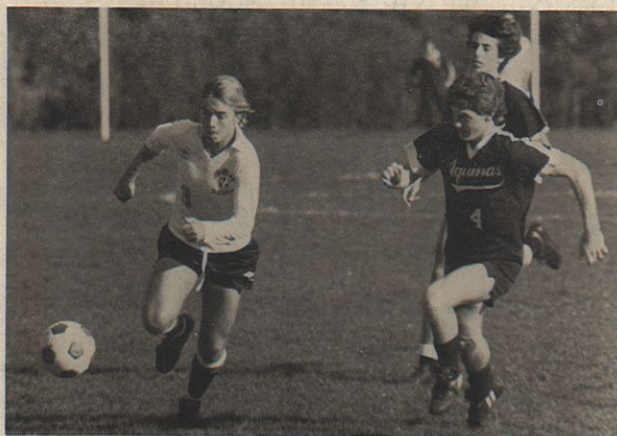
The Soccer Team had an excellent year finishing 3rd in league and reaching the \frac{1}{4} finals in Sec.V. The JV and Frosh were successful so next year should be exciting.